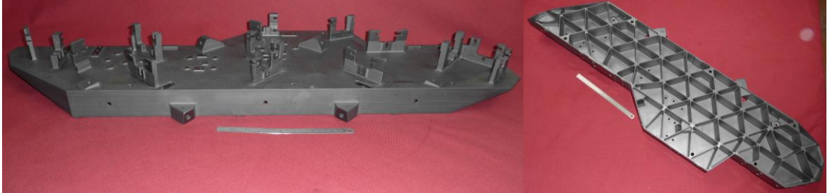
Fig. 6. Views of the BAM large base-plate (0.92 m x 0.28 m - only 5.6 kg)

The extremely accurate "Basic Angle" is monitored with help of interferometry. For that purpose, the GAIA payload includes 2 optical benches. The main SiC part of them is a very lightweight base-plate (only 1 mm thick ribs) which includes a lot of brackets for mounting all the optics.