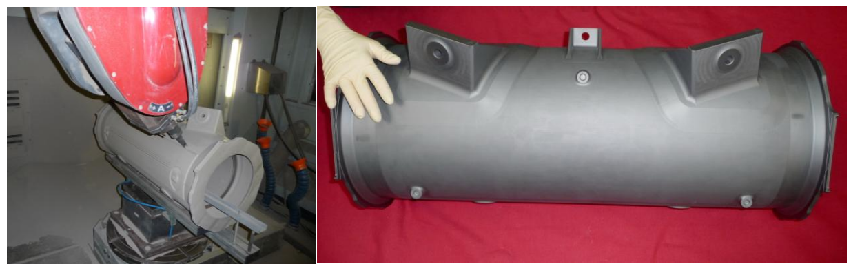
Fig. 2. One of the 19 GAIA torus segments left ) during green machining, right ) ready for brazing assembly