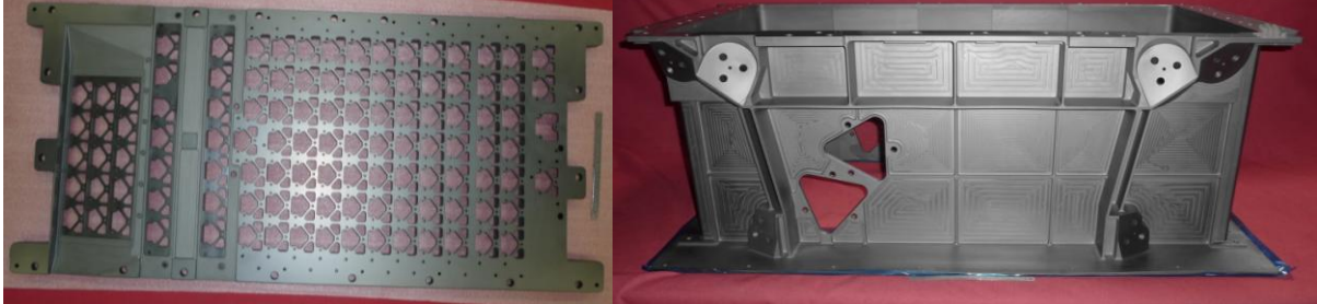
Fig. 5. Focal Plane Left ) The CCD supporting structure (1.15 m x 0.53 m - 11 kg) Right ) The Cold Radiator (1.17 m x 0.62 m x 0.41 m - 38 kg)

The 106 CCDs of GAIA are mounted on individual SiC substrates and then bolted on a large base-plate, the CCD supporting structure. Beside the main Astro CCD plane, it features 3 other planes which are tilted with different angles. This base-plate is then bolted on the Cold Radiator for stiffening and cooling purpose. All the useful areas of these both large SiC parts have been polished to a local flatness of 1 µm by the company WINLIGHT. The Cold Radiator is very large in its 3 dimensions (Fig. 5). It includes 6 accurately located interfaces areas which allow to hanging it under the torus, with help of thermally insulated bars.