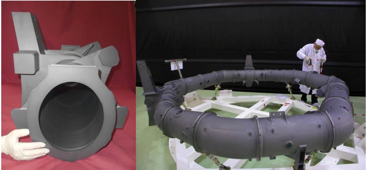
Fig. 4. Torus Left) Torus segment before brazing Right) Reception of the torus assembly in Astrium (< 200 kg)

accurately until the end of the brazing run (a single one!) which is performed around 1500°C. An ultrasound based technique has been developed specifically with the CEA (the French Nuclear Agency) for checking all the brazed joints. It allowed the detection and the cartography of possible voids down to a few mm<sup>2</sup>. No significant defects were found in the brazed joints.